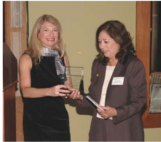
Congresswoman Solis receives an award from WHA.