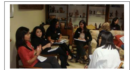
Sharing ideas in the Our Kitchen Table exercise